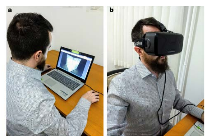
Figure 1. Online and Head Mounted Virtual Reality Test Mediums. a: online social environments, and b: head mounted displays are commonly used as virtual reality test mediums.